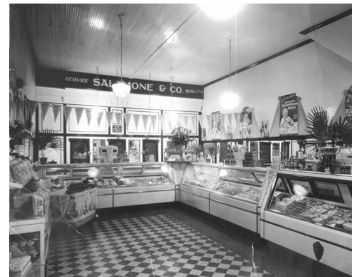
Salamone & Co. was located at 614 E. Grand in a building the Carom Room now calls home.

On and on goes the list of names of families running grocery stores throughout the city of Beloit. Some chain stores popped up in the listings toward the middle of the 20s, such as the Great Atlantic & Pacific Tea Co. and Piggly Wiggly. Kroger Grocer and Baking Co. made its debut in 1930, and by 1941 Crystal Foods operated a couple of stores.