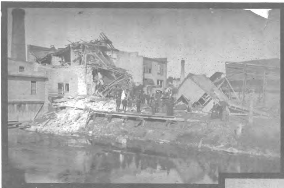
The Rock River Paper Mill