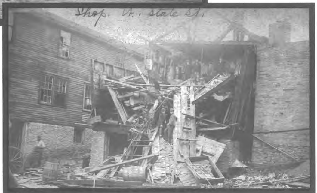
Rear view Kinsley Carriage Works on North State St.