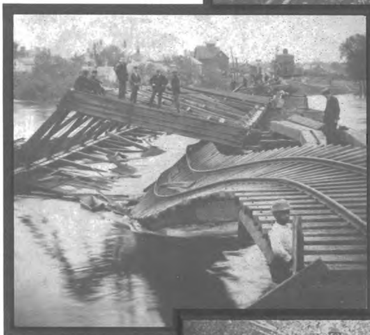
Chicago- Northwestern Railroad bridge.