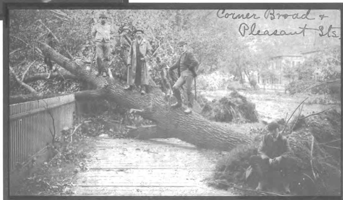
Across from Presbyterian Church, Broad and Pleasant.