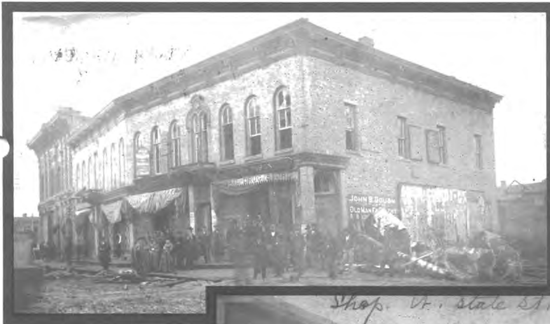
Northwest corner of State and Grand. Emerson Drugs on the corner.

In light of the recent hurricanes and tropical storms pounding the south eastern United States, we think it of interest to our readers to take a look at Beloit's most historic storm. On June 11, 1883, at 6:00 p.m., a cyclone hit Beloit, killing one man, severely wounding a dozen others, and caused $100,000 worth of damage (nearly 2 million in today's dollars.) The two minute blast had a dramatic impact on nineteenth-century Beloiters and was a topic of discussion into the mid-twentieth. Following is a photo-essay from the Society's archives.