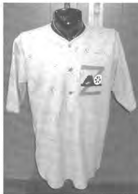
Z Engine Baseball Uniform. The Z engine was manufactured by Fairbanks Morse, and the "Z" was used on uniforms worn by the Fairbanks Fairies baseball club.