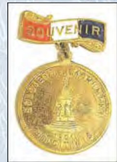
An example of a souvenir sold to raise money for the monument, from the BHS collections.