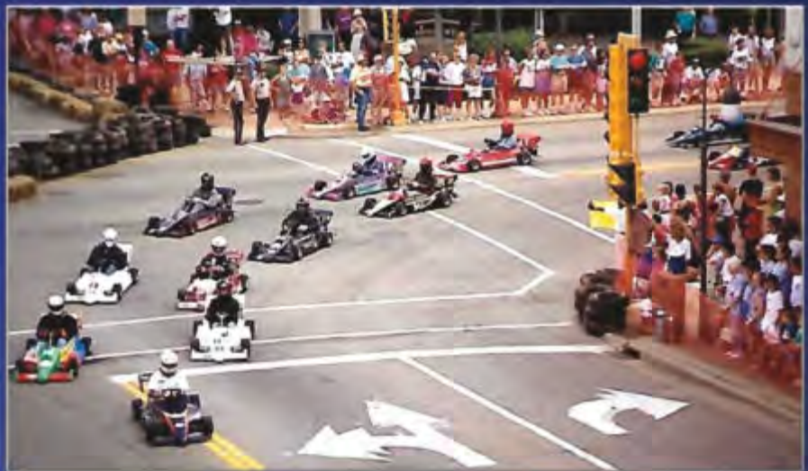
Grand Prix Race in downtown Beloit 1993

Ticket pre-sales will begin April 12th on our website