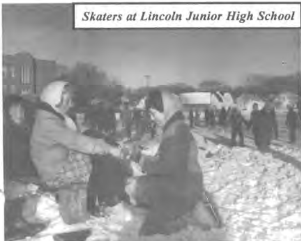
Skaters at Lincoln Junior High School