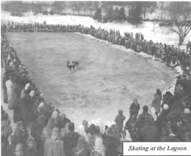
Skating at the Lagoon